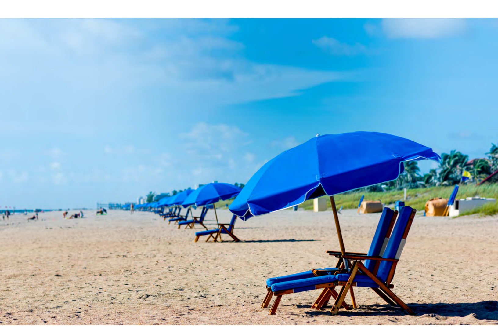
America's First Resort Destination™